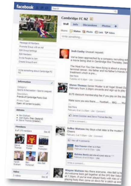
The club's Facebook page

The Facebook pages are full of photographs, banter and even a few videos guaranteed to raise a smile.