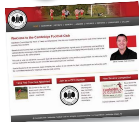
The home page of our website

The club maintains a website to help members keep informed about vital information such as the season's fixtures, results and match reports.